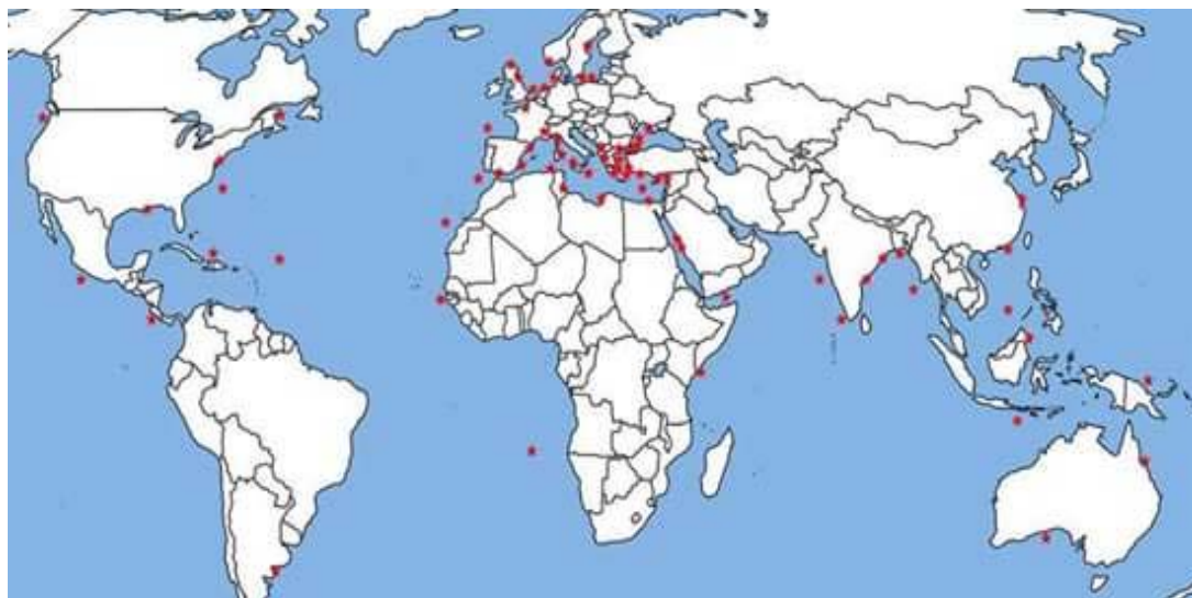
Figure 1: The OJT sites (ships) of Maritime Students of a University as of July 2016