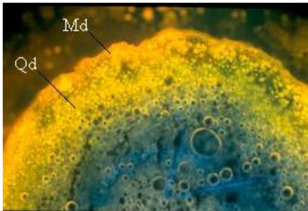
Figure 2 : The histochemical study from the stem of A. spinosa showed a high content of myricetin derivatives (Md) in the peripheral tissues. Qd : Quercetin derivatives.